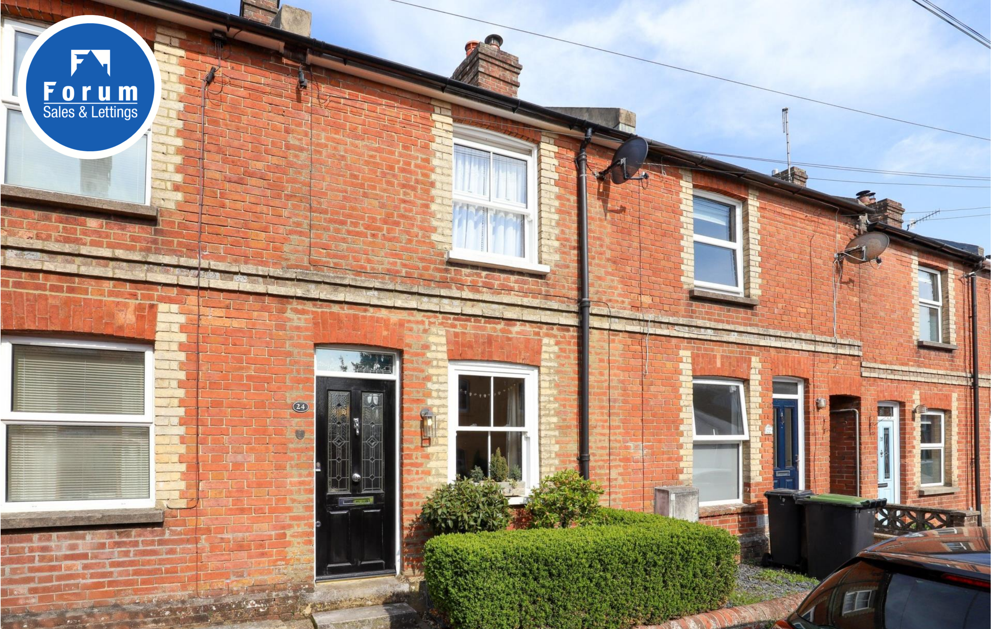
24 Victoria Road, Blandford Forum, Dorset, DT11 7JP