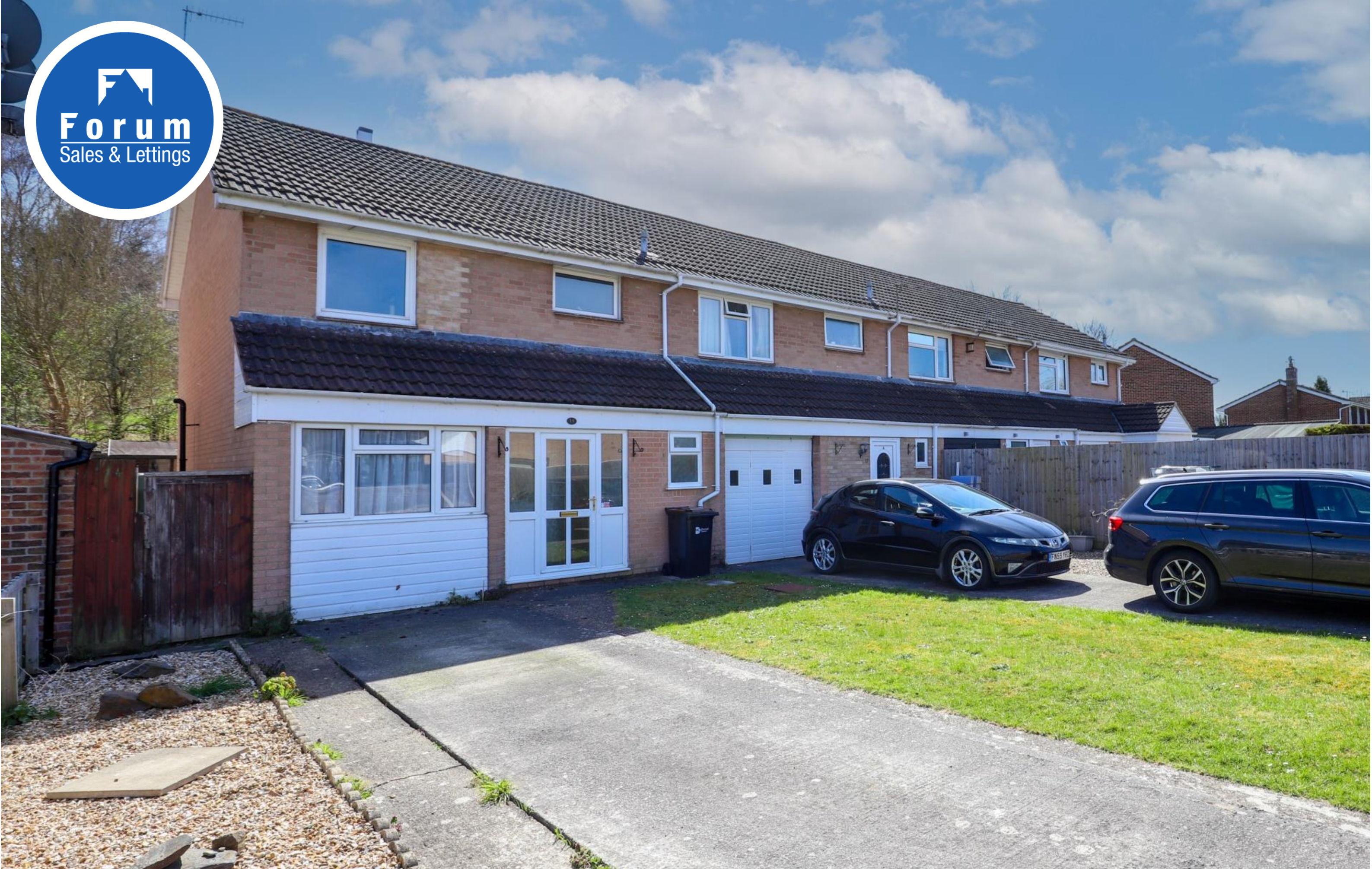
15 Downside Close, Blandford Forum, Dorset, DT11 7SD