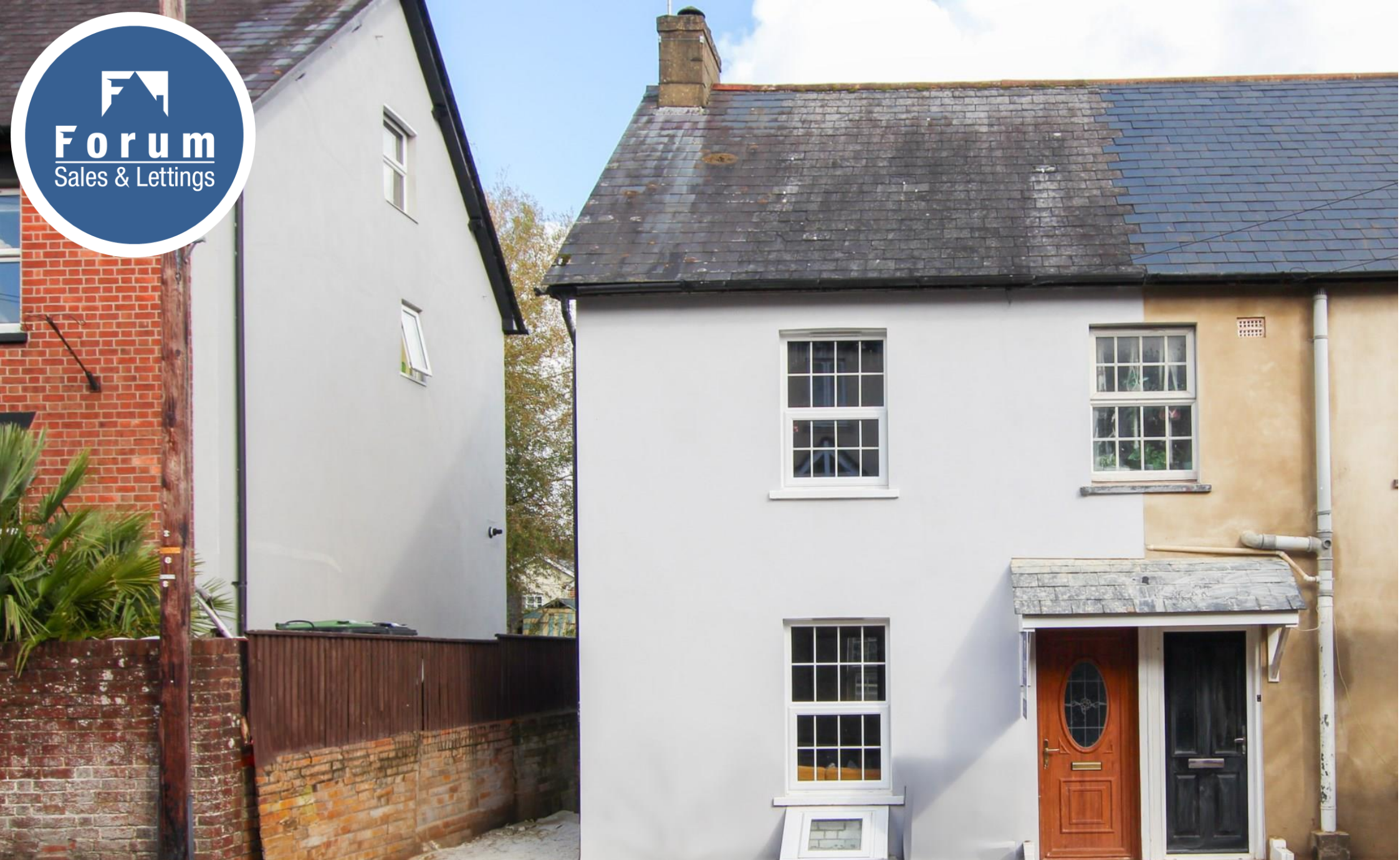
19 Damory Street, Blandford Forum, Dorset, DT11 7EU