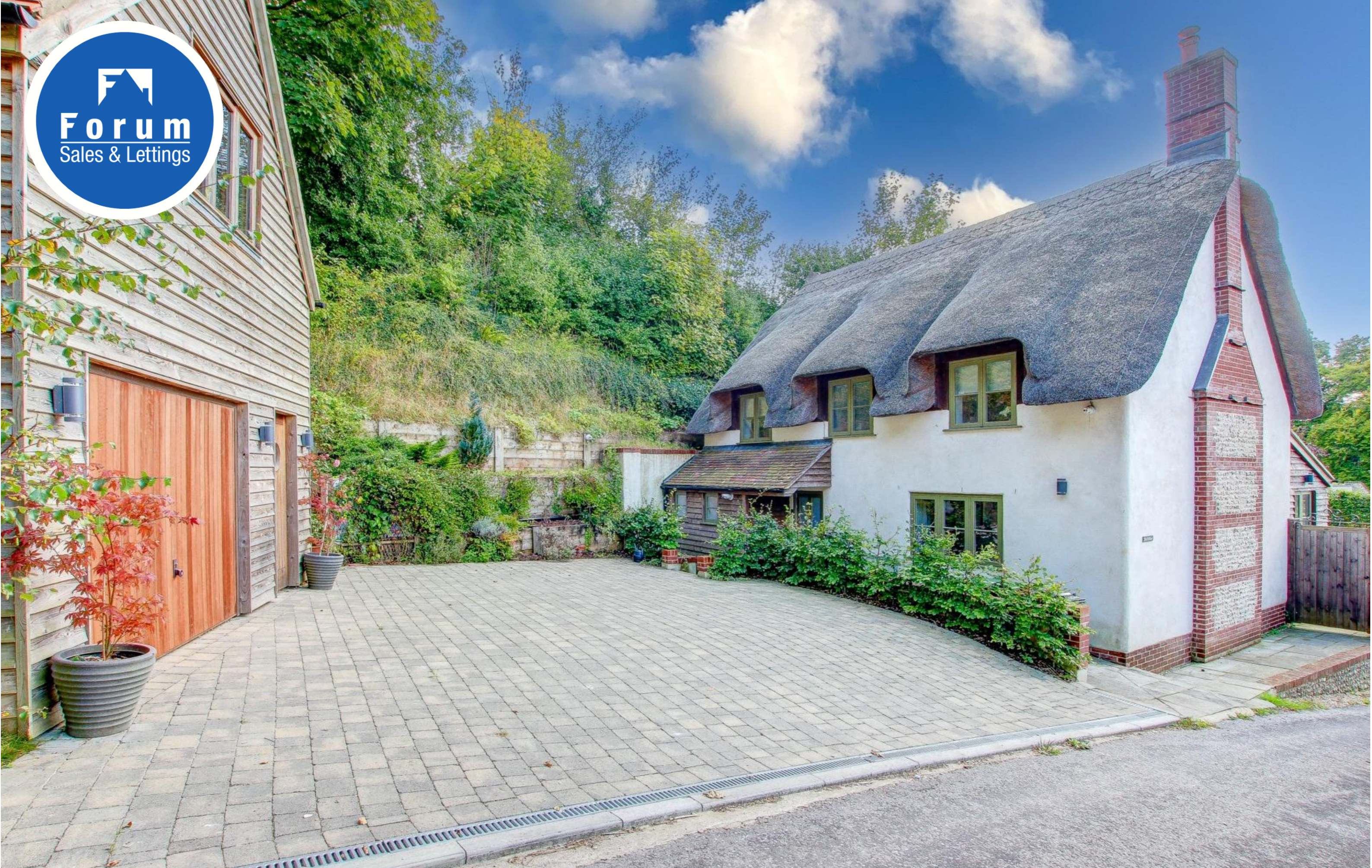
The Hollow, Chalky Path, Winterborne Stickland, Dorset, DT11 0NS