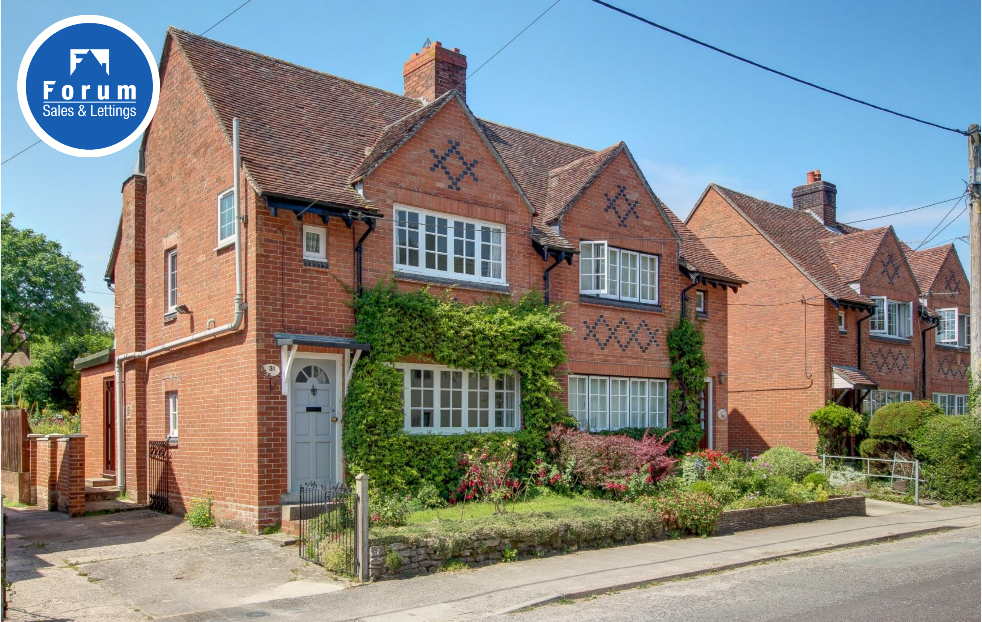
31 North Street, Winterborne Stickland, Dorset, DT11 0NH