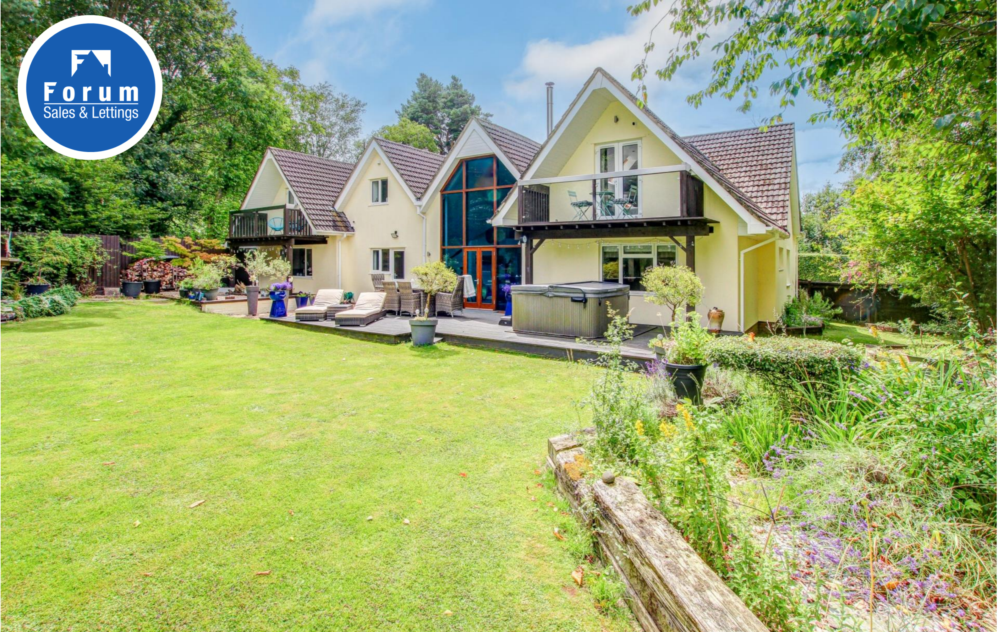
Silver Birches, Bushes Road, Stourpaine, Dorset, DT11 8SU