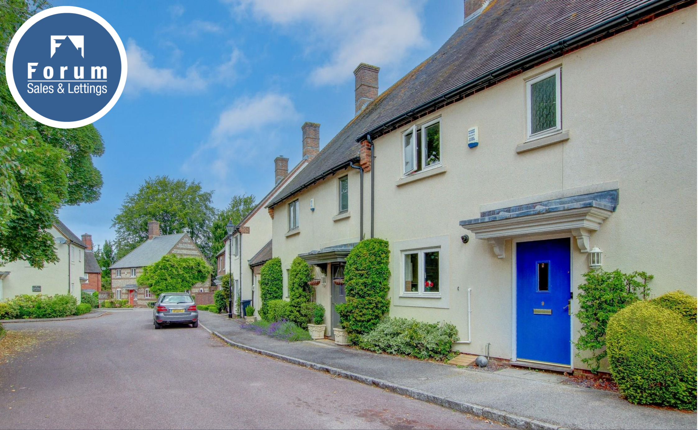
9 Badger Sett, Blandford St Mary, Dorset, DT11 9QL