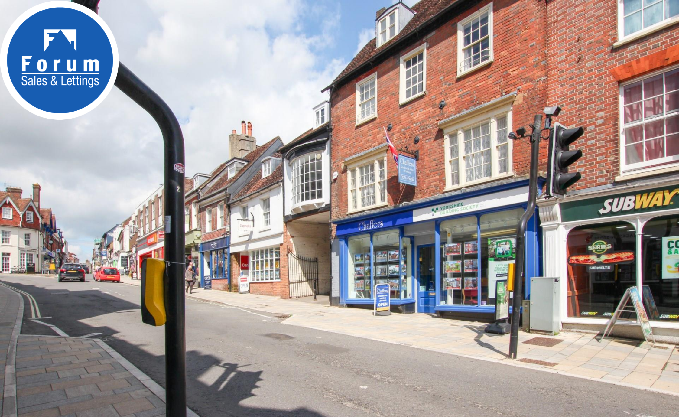
18a Salisbury Street, Blandford Forum, Dorset, DT11 7AR