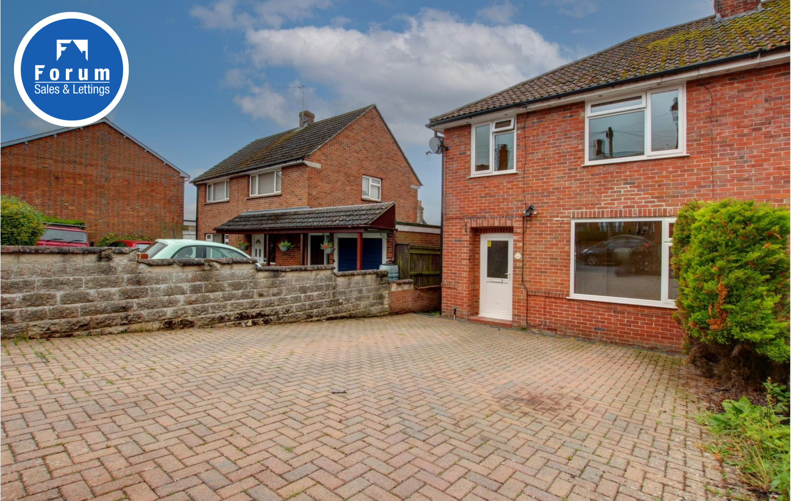
Rosecroft, Victoria Road, Blandford Forum, Dorset, DT11 7JR