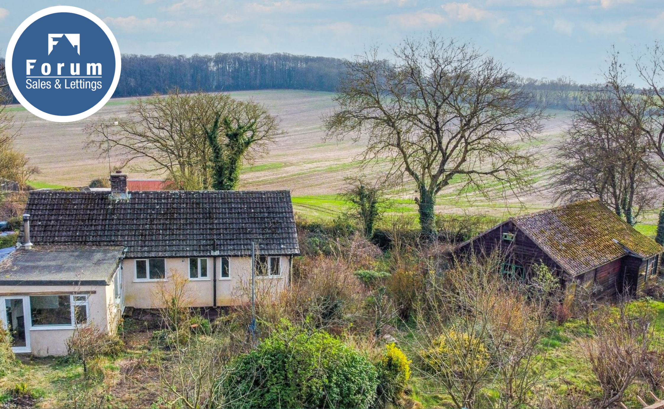
Orchard Cottage, Thornicombe Hill, Thornicombe, Dorset, DT11 9AH