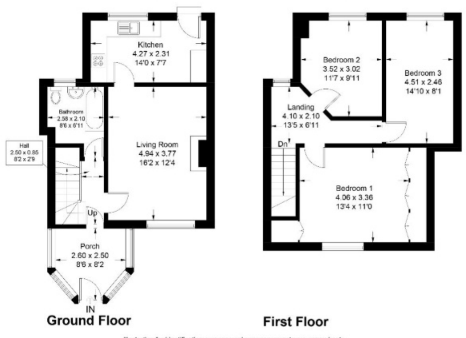
Illustration for identification purposes only, measurements are approximate, not to scale. Fourlabs.co @ (ID1182589)

Approximate Gross Internal Area = 94.3 sq m / 1015 sq ft