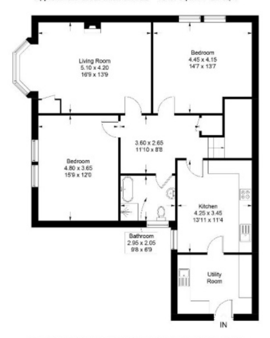
Illustration for identification purposes only, measurements not to scale. Fourlabs.co @ (ID1188619) nts are approximate.

Approximate Gross Internal Area = 104.4 sq m / 1124 sq ft