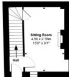
Ground Floor Approximate Area: 17.5 m 2 ... 188 ft 2