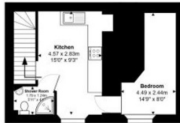
1st Floor Approximate Area: 27.3 m 2 ... 294 ft 2

Whilst every attempt has been made to ensure the accuracy of the floor plan contained here, measurements of floors, windows, rooms and any other items are approximate and no responsibility is taken for any error, omission or mis-statement. This plan is for illustrative purposes only and should be used as such by any prospective purchaser or tenant. The services, systems and appliances shown have not been tested and no guarantee as to their operability or efficiency can be given.