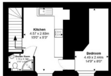
1st Floor Approximate Area: 27.3 m 2 ... 294 ft 2

Whilst every attempt has been made to ensure the accuracy of the floor plan contained here, measurements of floors, windows, rooms and any other items are approximate and no responsibility is taken for any error, omission or mis-statement. This plan is for illustrative purposes only and should be used as such by any prospective purchaser or tenant. The services, systems and appliances shown have not been tested and no guarantee as to their operability or efficiency can be given.