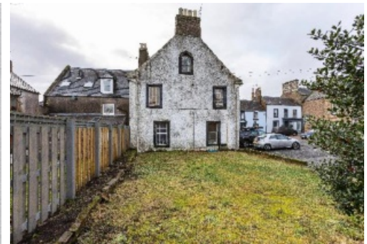
18 & 20 Castle Street, Duns, TD11 3DP