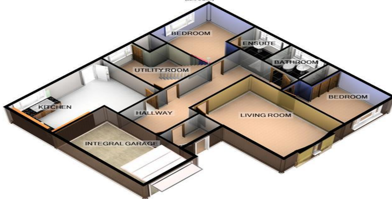
GROUND FLOOR APPROX. FLOOR AREA 1122 SQ.FT. (104.2 SQ.M.)