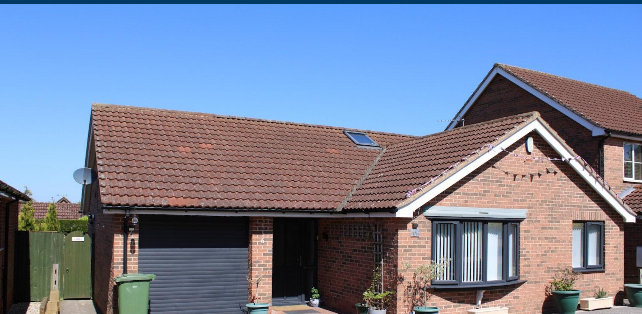
Archers Close, Wrawby