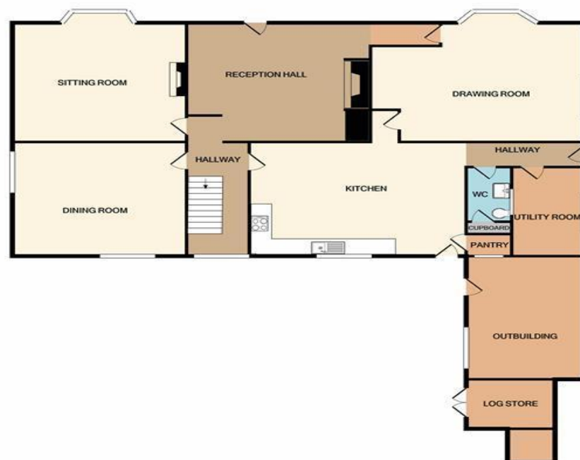
GROUND FLOOR APPROX. FLOOR AREA 2137 SQ.FT. (198.6 SQ.M.)