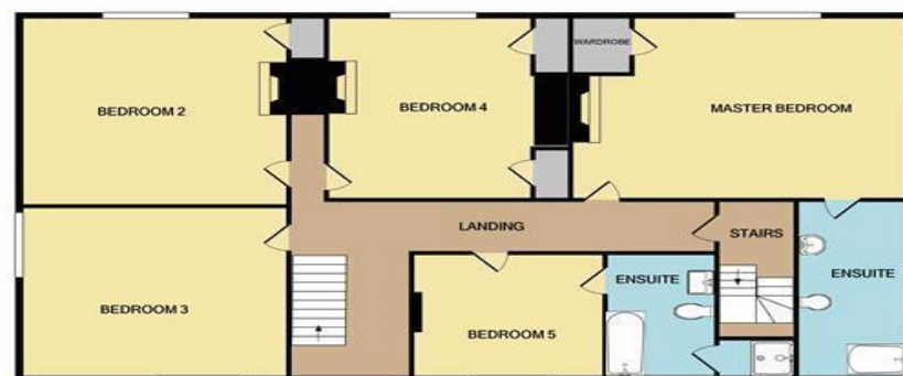
1ST FLOOR APPROX. FLOOR AREA 1584 SQ.FT.