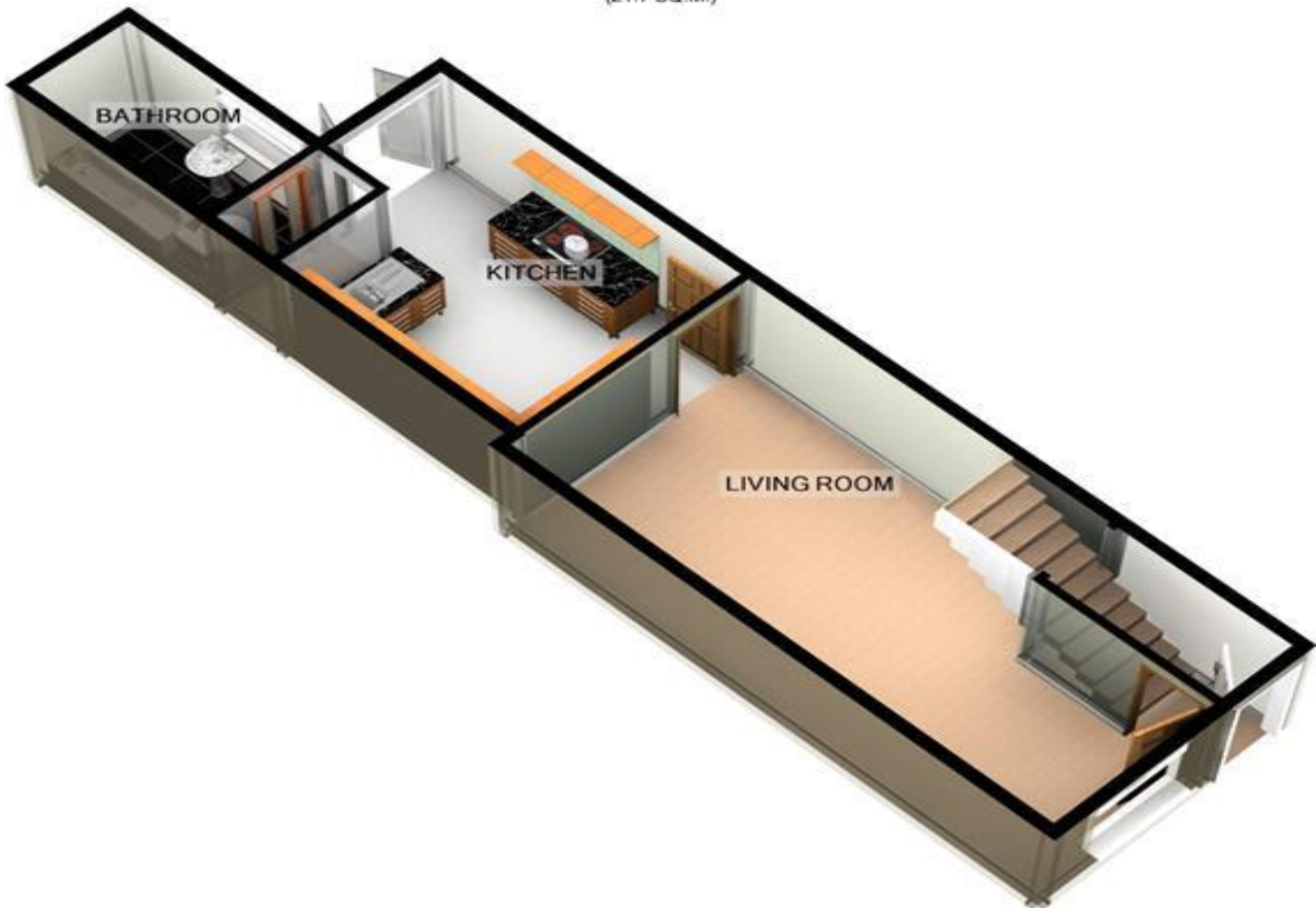
GROUND FLOOR APPROX. FLOOR AREA 406 SQ.FT. (37.7 SQ.M.)

TOTAL APPROX. FLOOR AREA 639 SQ.FT. (59.4 SQ.M.)