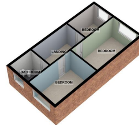
TOTAL FLOOR AREA : 812 sq.ft. (75.4 sq.m.) approx.

For illustrative purposes only. Decorative finishes, fixtures, fittings and furnishings do not represent the current state of the property. Measurements are approximate. Not to scale. Made with Metropix © 2023