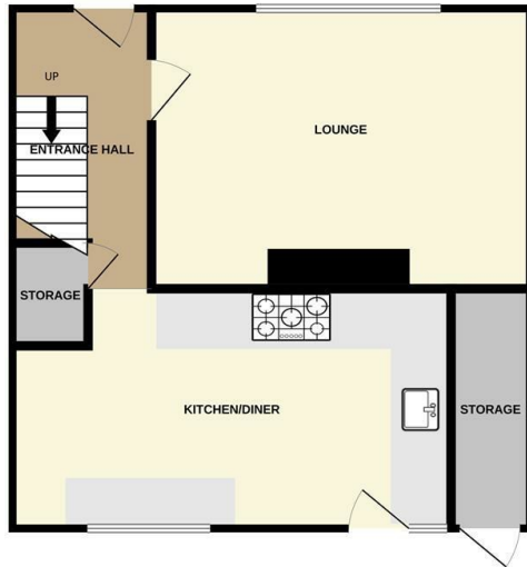
GROUND FLOOR 451 sq.ft. (41.9 sq.m.) approx.