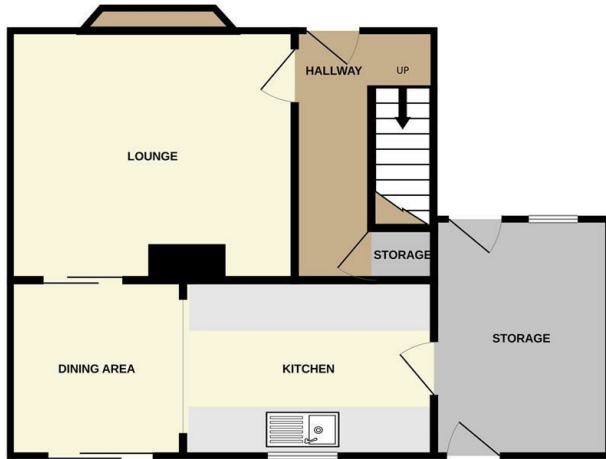
GROUND FLOOR 495 sq.ft. (46.0 sq.m.) approx.