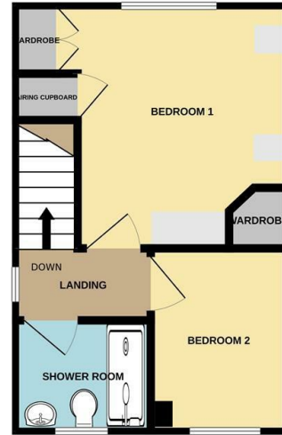
1ST FLOOR 249 sq.ft. (23.1 sq.m.) approx.