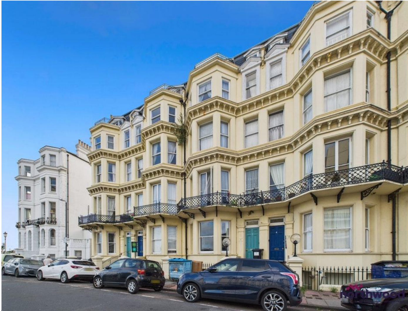
Queens Gardens, Eastbourne