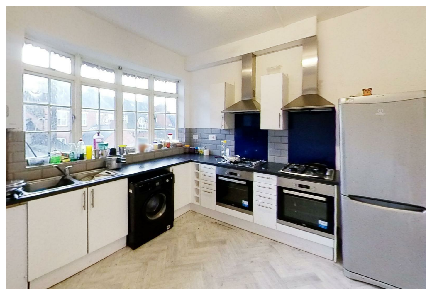
169B London Road, Leicester, Leicestershire LE2 1EG