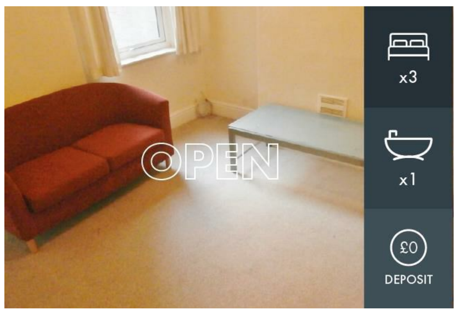
124 Lytton Road, Leicester, Leicestershire LE2 3BX