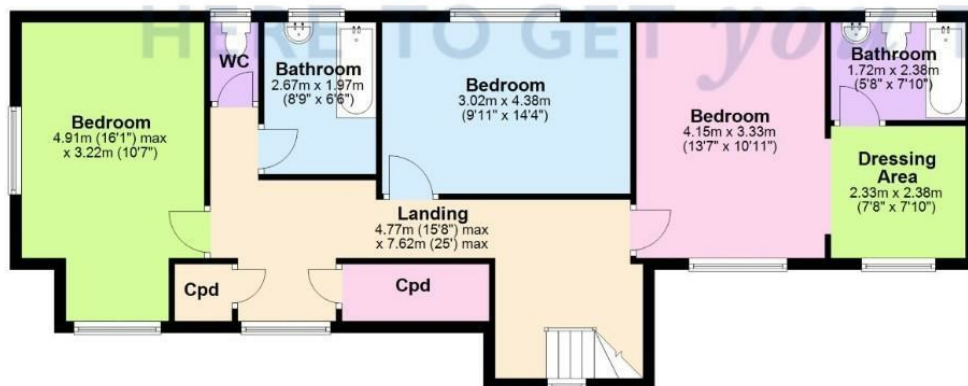
First Floor Approx. 82.5 sq. metres (888.4 sq. feet)