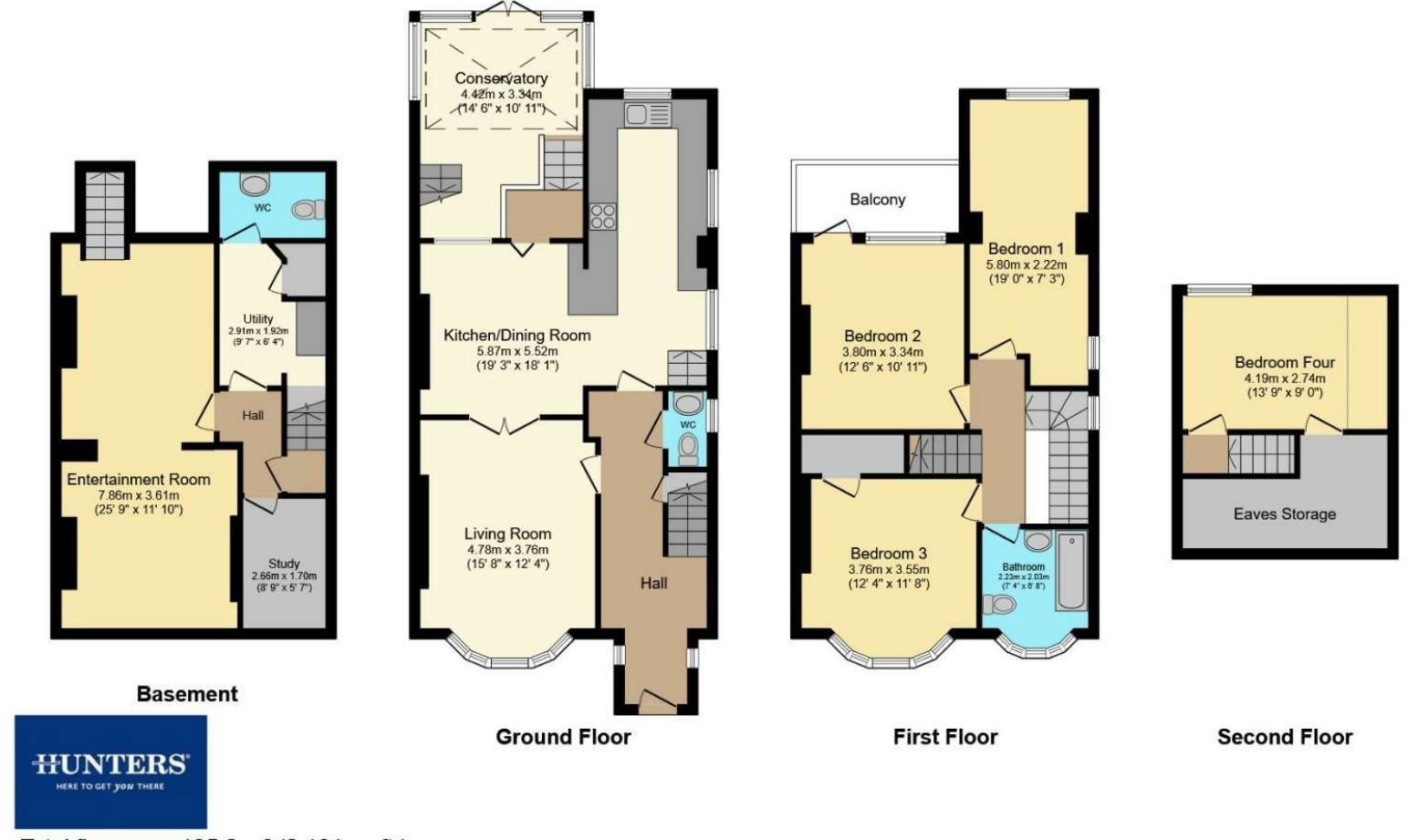
Total floor area 195.2 m<sup>2</sup> (2,101 sq.ft.) approx

This floor plan is for illustrative purposes only. It is not drawn to scale. Any measurements, floor areas (including any total floor area), openings and orientation are approximate. No details are guaranteed, they cannot be relied upon for any purpose and they do not form part of any agreement. No liability is taken for any error, omission or misstatement. A party must rely upon its own inspection(s). Powered by www.focalagent.com