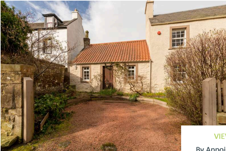
Top right image - page 5