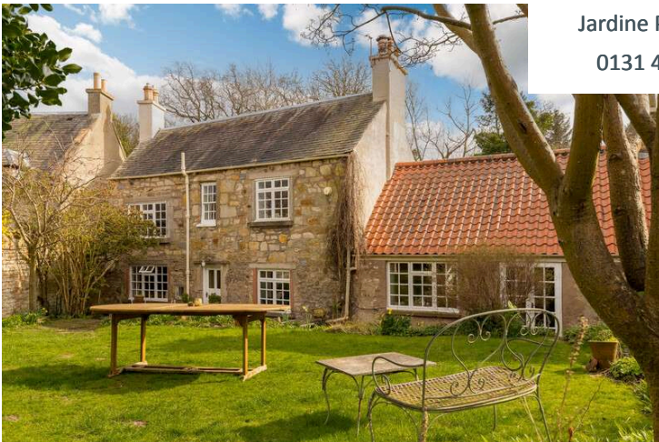
Bottom right image - page 5