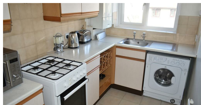
The Worthys Bradley Stoke BS32 8DQ