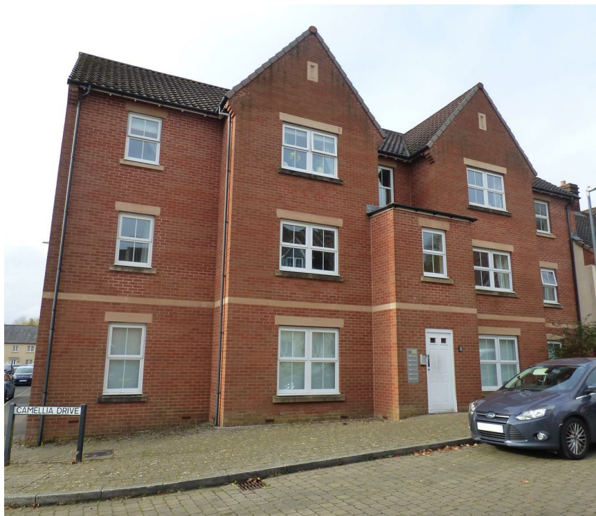
Camellia Drive Bristol BS32 4DA