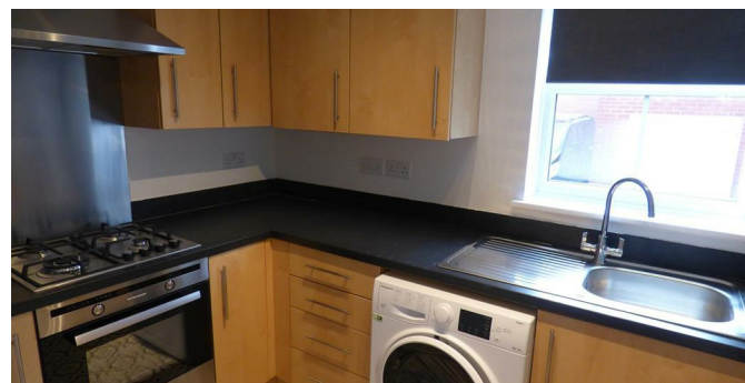
Price: £1,000 PCM