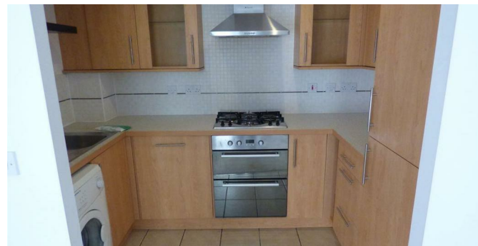
Price: £1,250 PCM