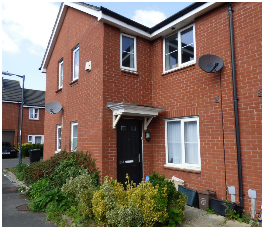
Eden Grove BRISTOL BS7 0PW