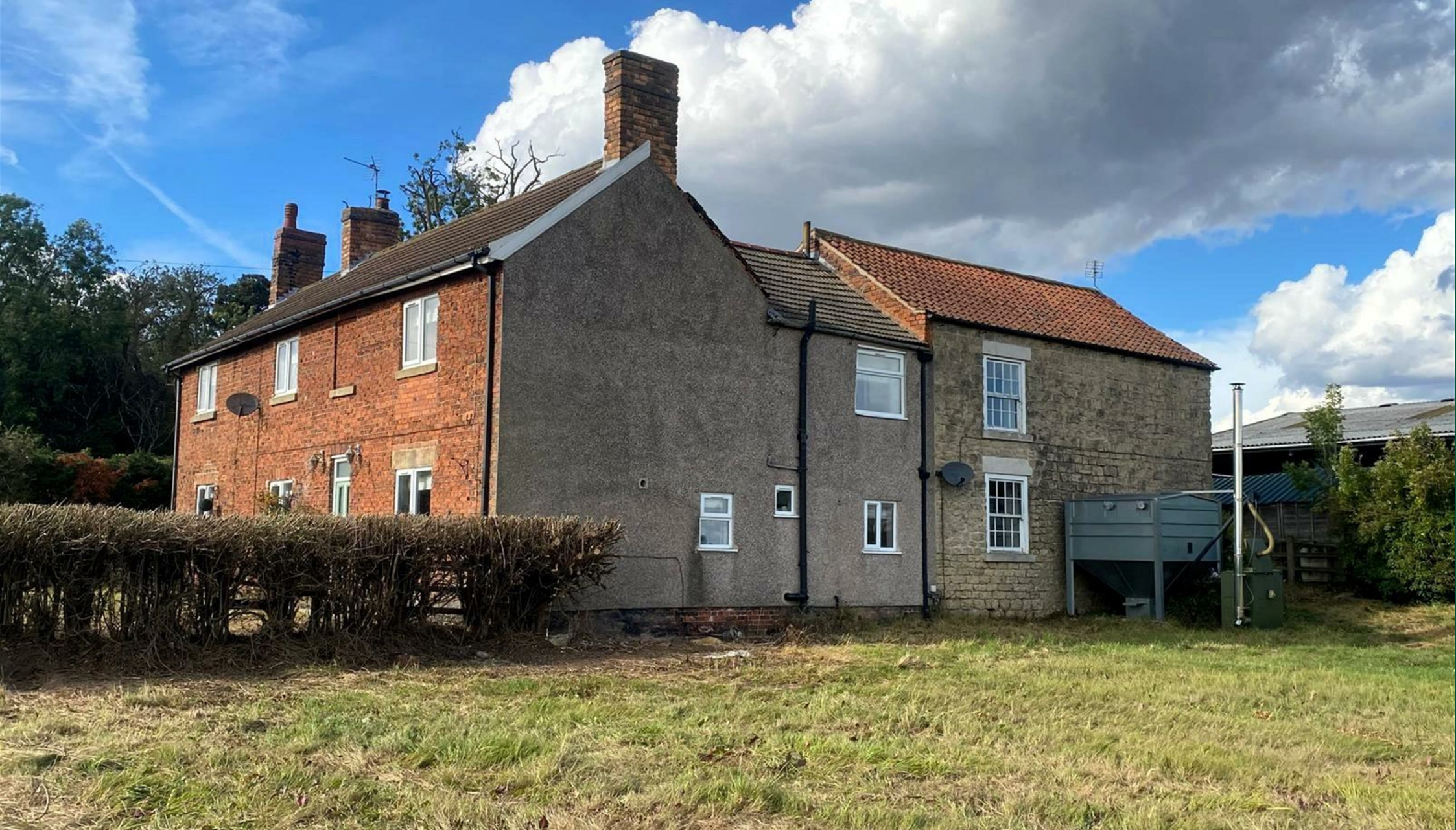
Speetley Farmhouse, Speetley Farm Cottage & Detached Stone Barn Barlborough, Chesterfield, S43 4TA Guide Price £790,000