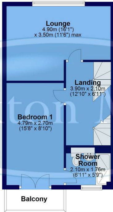
First Floor Approx. 41.0 sq. metres (441.7 sq. feet)