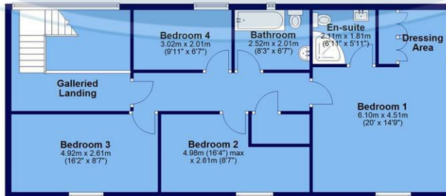
Main area: Approx. 178.3 sq. metres (1919.3 sq. feet) Plus garages, approx. 44.3 sq. metres (477.1 sq. feet)

All measurements are approximate and to max vertical and horizontal lengths Plan produced using PlanUp.