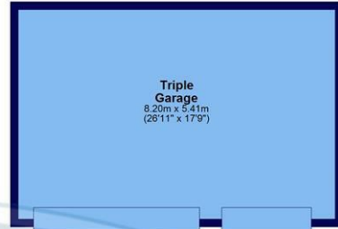
Ground Floor Main area: approx. 89.2 sq. metres (959.7 sq. feet) Plus garages approx. 44.3 sq. metres (477.1 sq. feet)