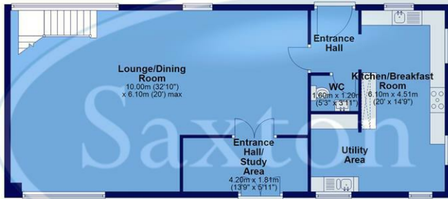
First Floor Approx. 89.2 sq. metres (959.7 sq. feet)