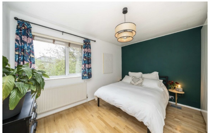
Foxborough Gardens, SE4