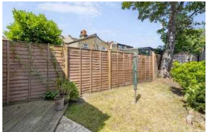
Bradgate Road, SE6