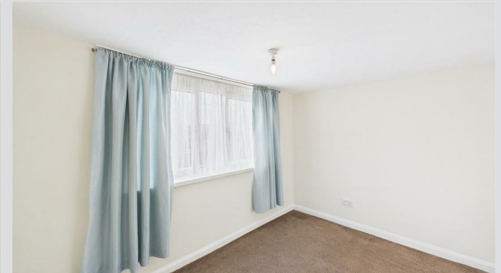
Bedroom 2 10'7" x 7'9"