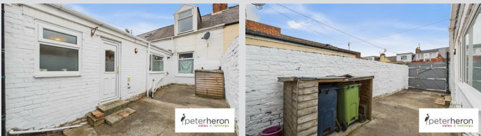
Enclosed rear courtyard.