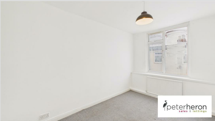
Double glazed window to front, radiator and built in wardrobes.