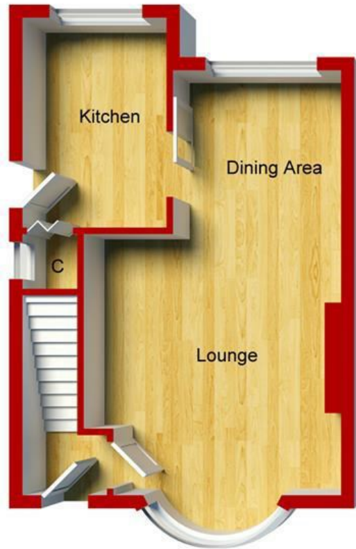
Ground Floor Approximate Floor Area (33.11 sq.m)