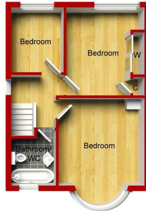
First Floor Approximate Floor Area (31.83 sq.m)