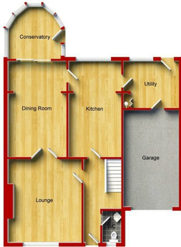
Ground Floor Approximate Floor Area (73.07 sq.m)