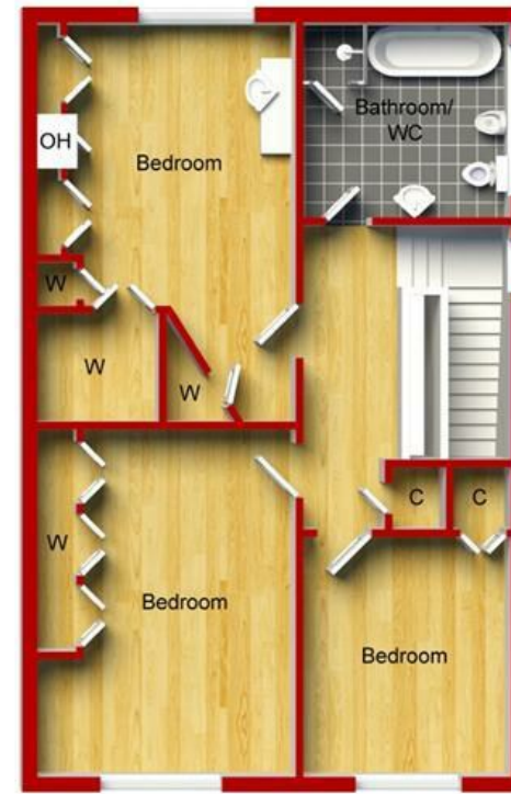
First Floor Approximate Floor Area (49.16 sq.m)