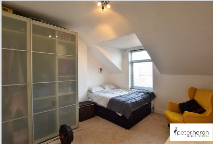
Double glazed window to rear, storage cupboard and double radiator.