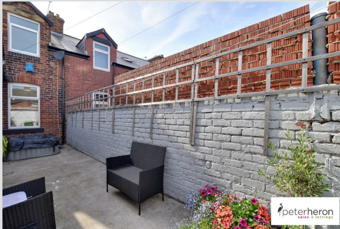
Enclosed rear courtyard