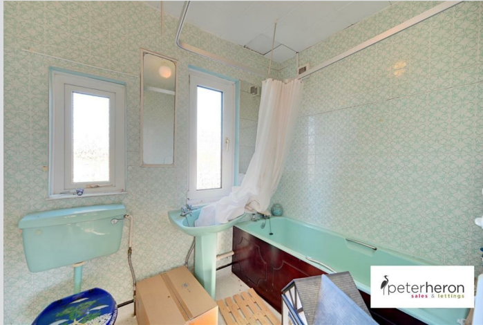
Low level WC, washbasin and panel bath, tiled walls, double glazed window and radiator.