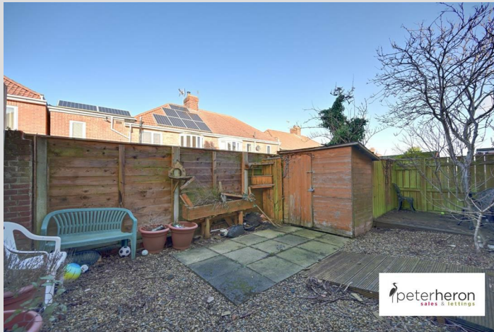
Gardens to the front and rear, together with a drive and garage.