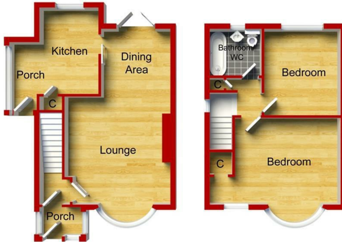
Ground Floor Approximate Floor Area (36.10 sq.m)