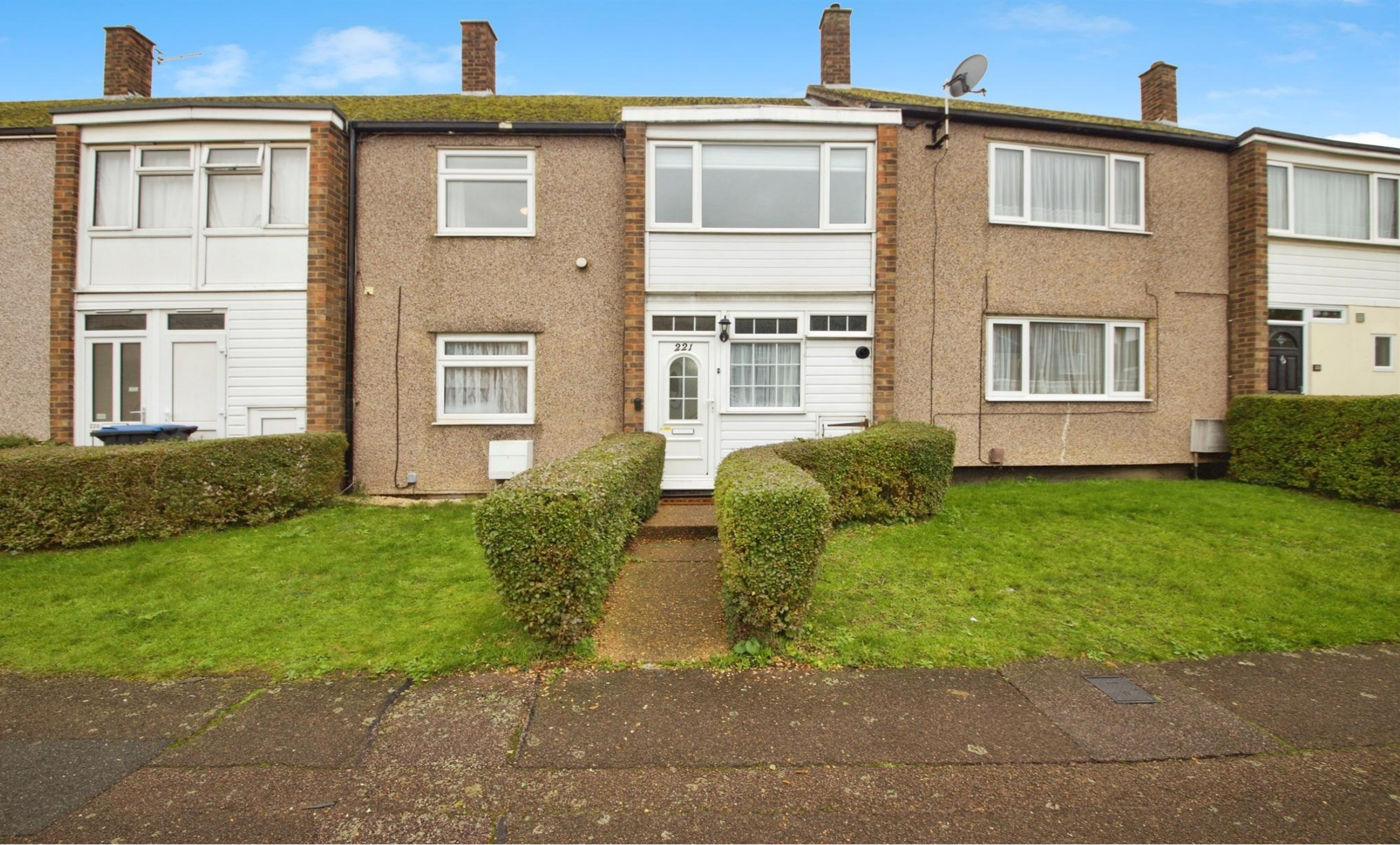
Rivermill, Harlow CM20 1PB