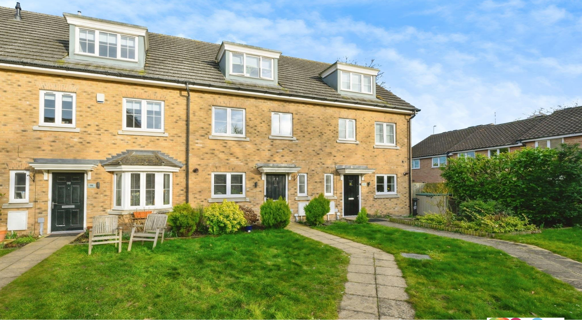
Blenheim Square, North Weald Epping CM16 6FQ