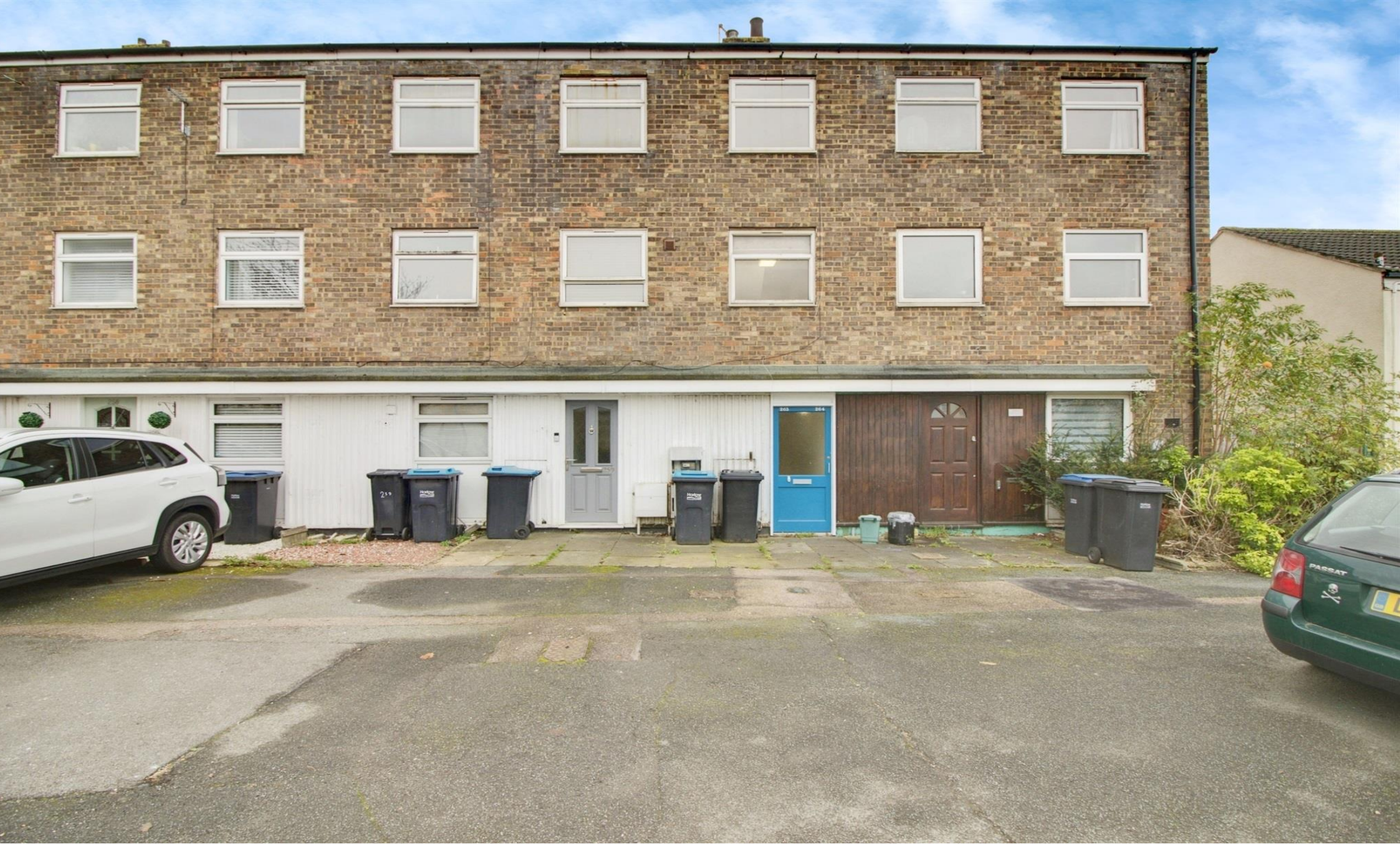
Rivermill, Harlow CM20 1PD