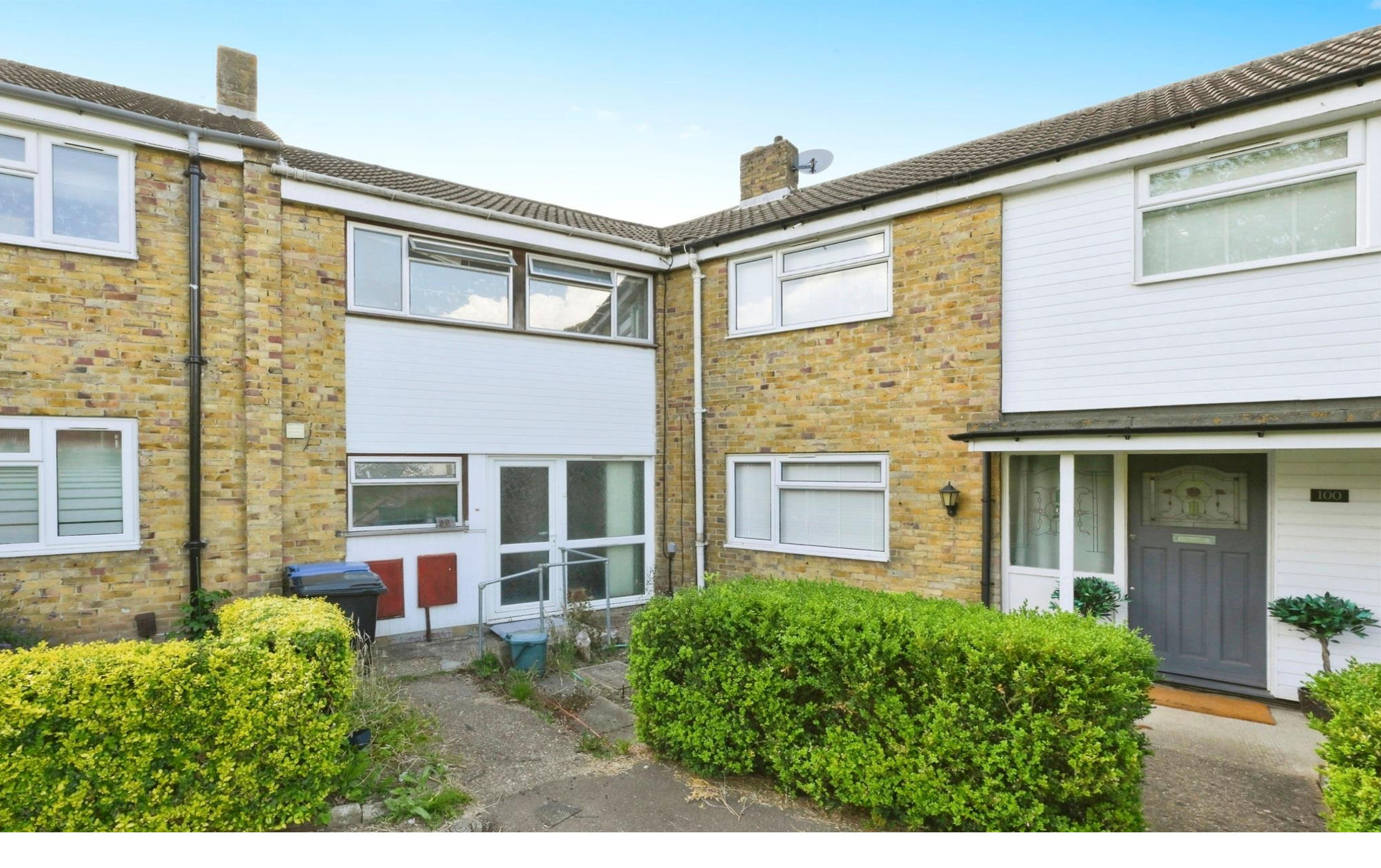
Little Pynchons, HARLOW CM18 7DF