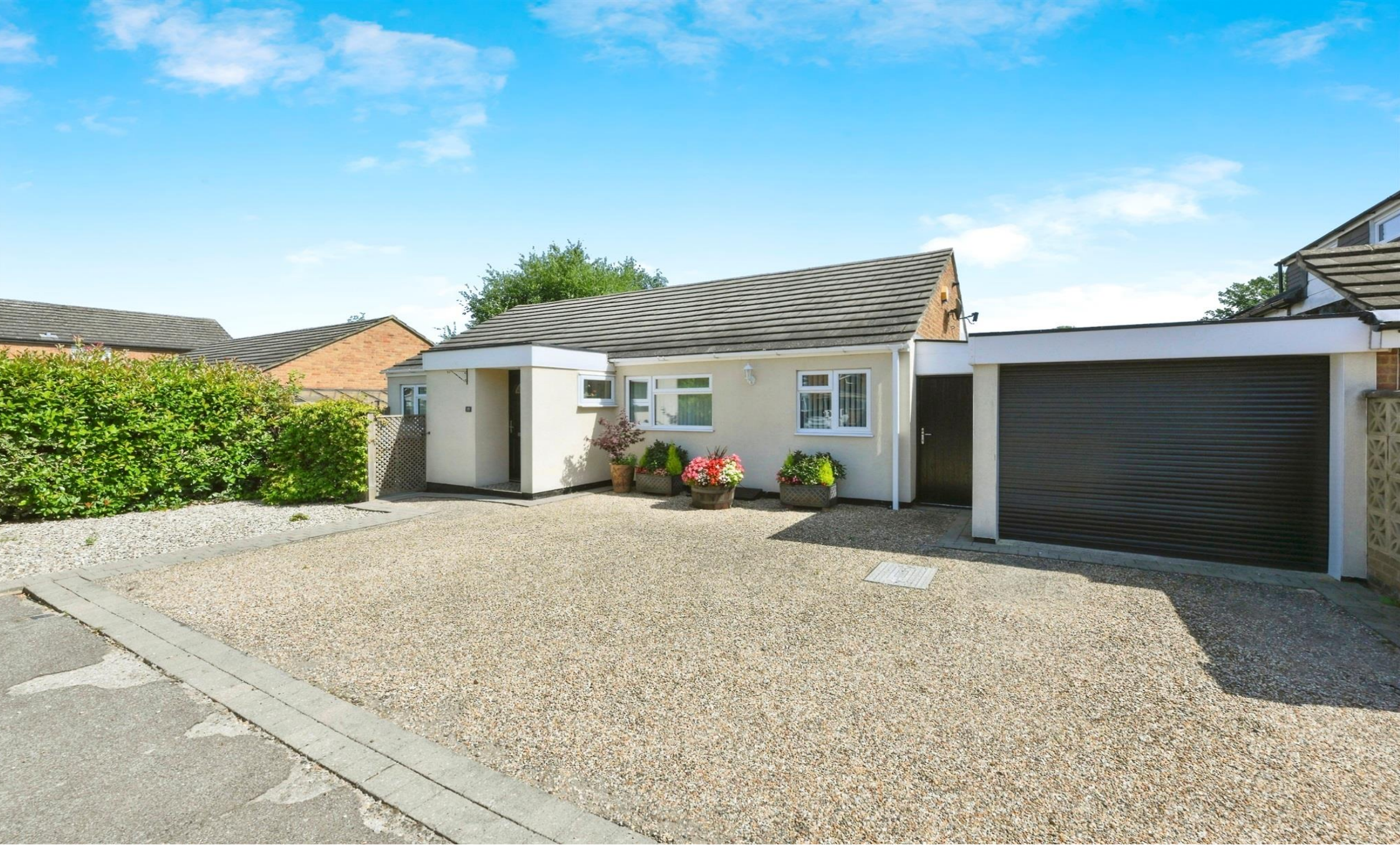
Paddock Mead, Harlow CM18 7RP