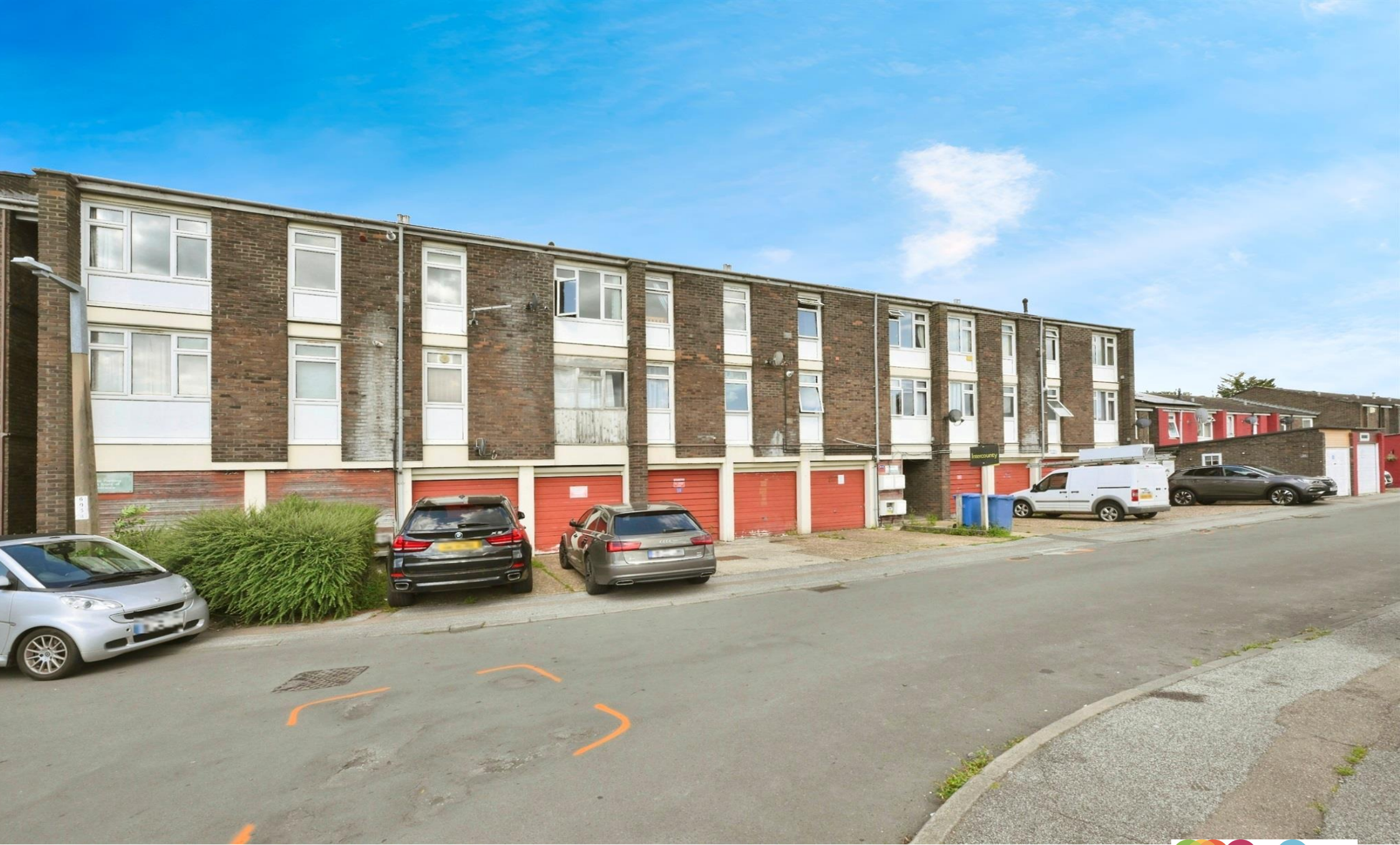
Peterswood, Harlow CM18 7RL